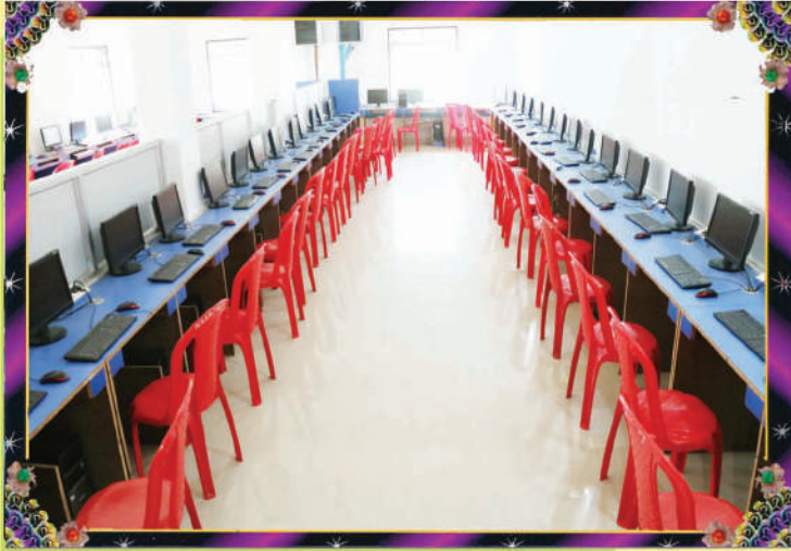
COMPUTER LAB. (CAD / CAM LAB.)