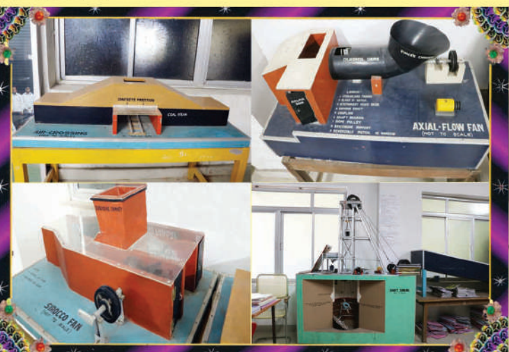
MINE VENTILATION LAB.