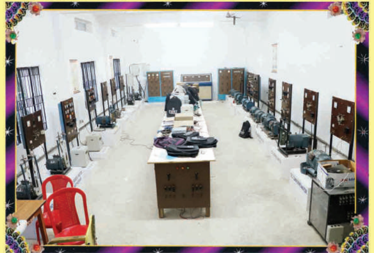
ELECTRICAL MACHINES SHOP DEPARTMENT OF MECHANICAL ENGG.