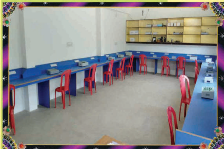
CIRCUIT THEORY LAB.