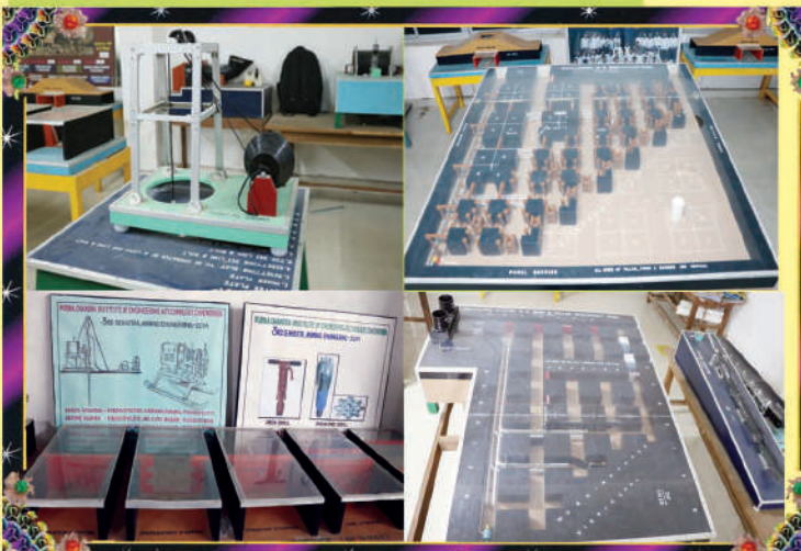
MINING ENGG. LAB.