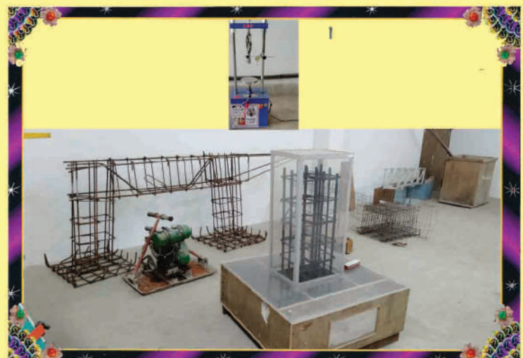
CONSTRUCTION WORKSHOP PRACTICE LAB.