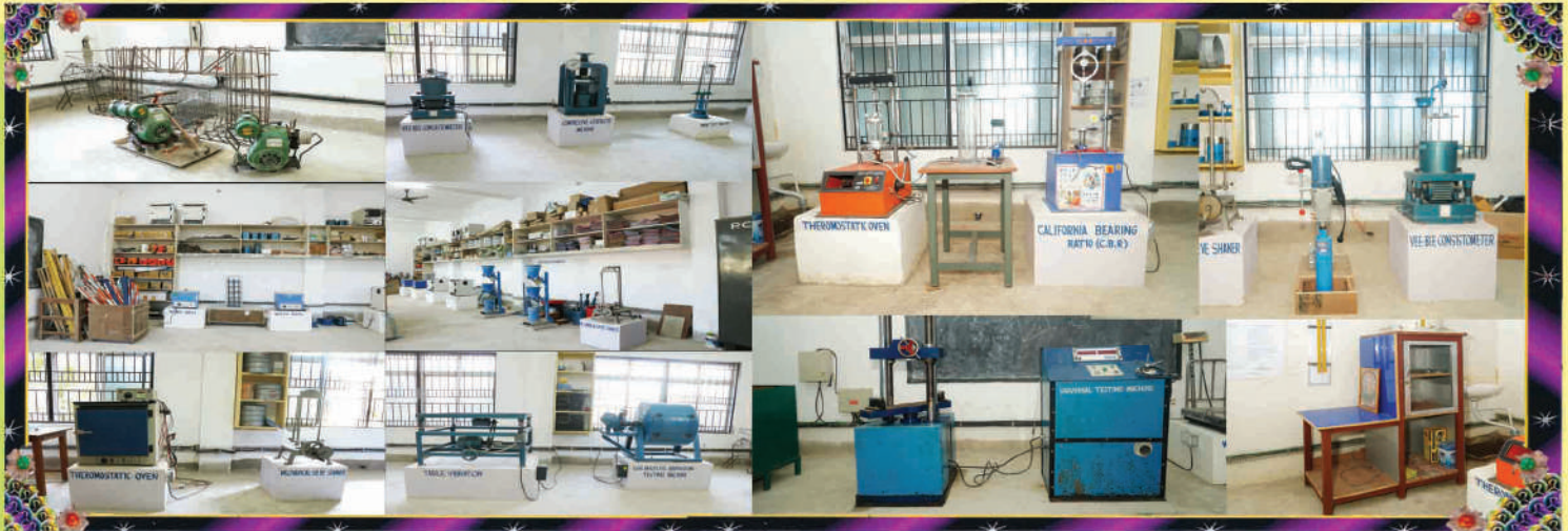
CONCRETE & SOIL LAB.