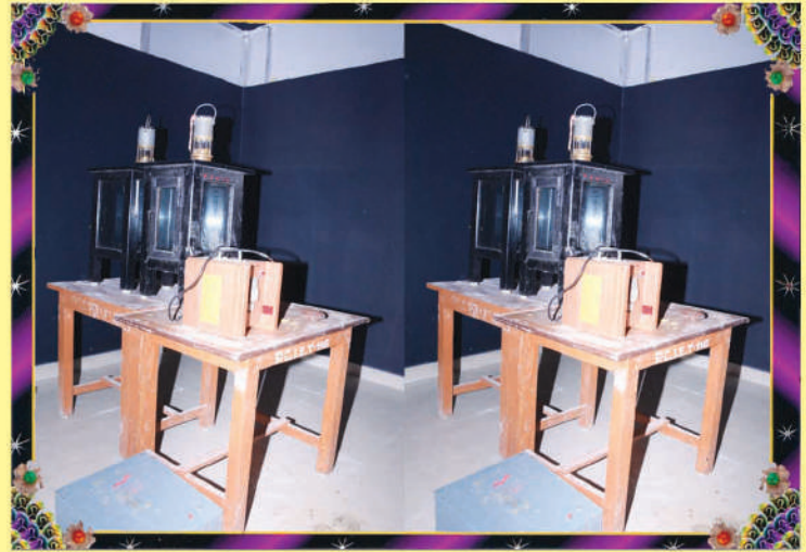
GAS TESTING LAB.