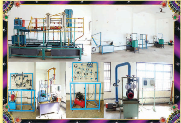
FLUID MECHANICS & HYDRAULIC MACHINES LAB.