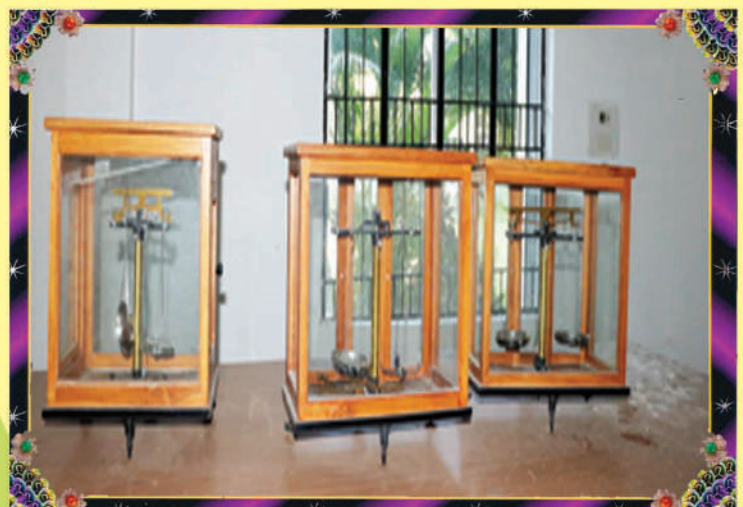
ENGG. PHYSICS LAB.