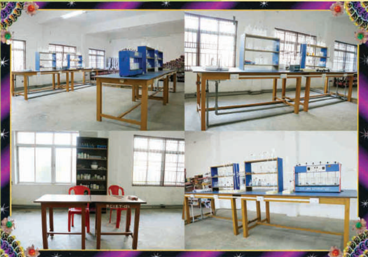
PUBLIC HEALTH ENGG. LAB.