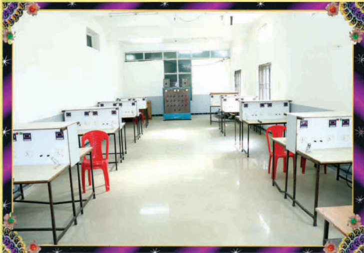
BASIC ELECTRONICS & ANALOG LAB.