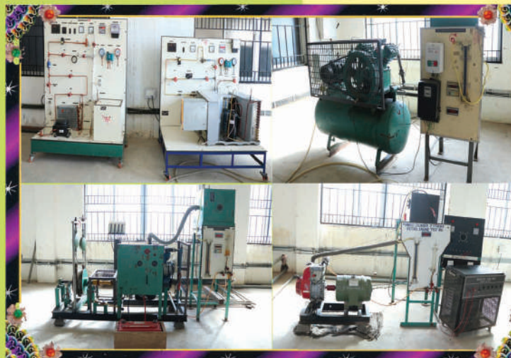
HEAT POWER & THERMAL ENGG. LAB.