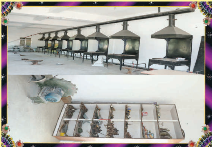
FOUNDRY & SHEET METAL SHOP