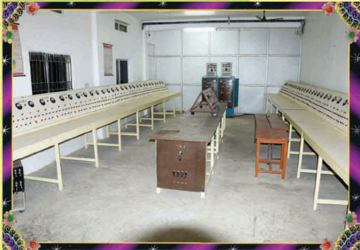
ELECTRICAL MEASUREMENT LAB.