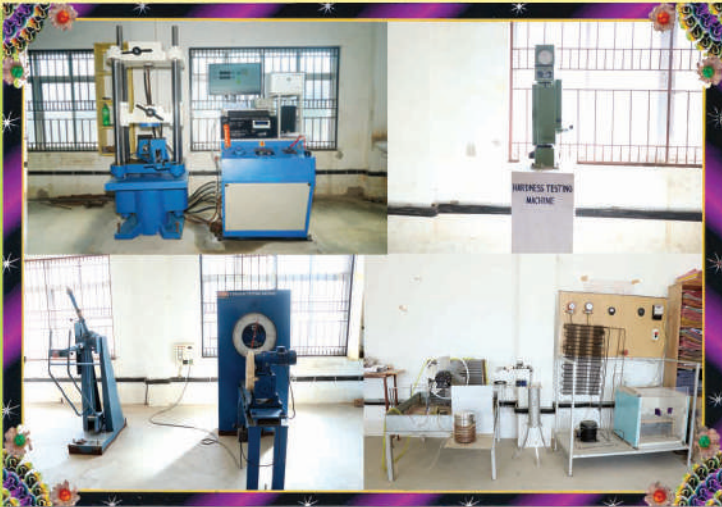
MATERIAL TESTING & MEASUREMENT LAB.