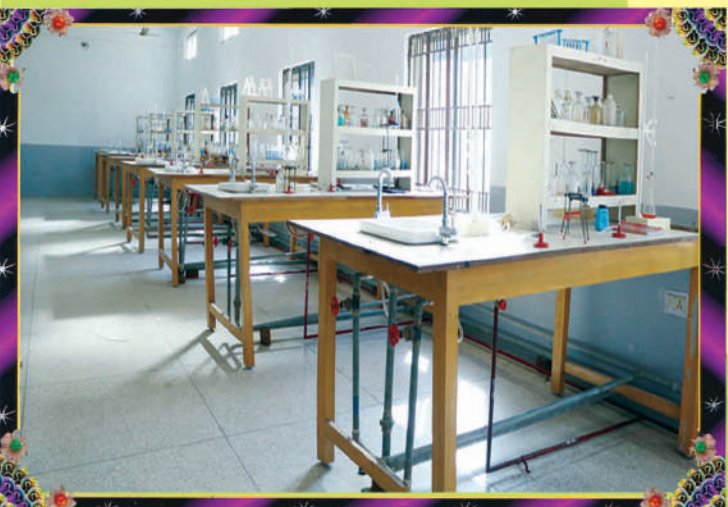
ENGG. CHEMISTRY LAB.