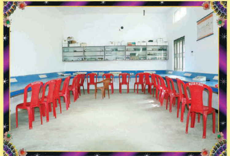
DIGITAL ELECTRONICS & MICRO PROCESSOR LAB.